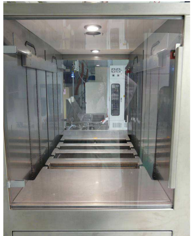
- Automatic Transfer System -