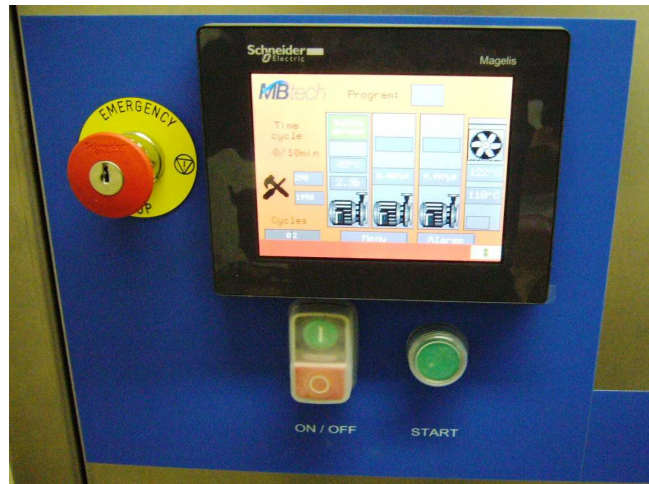
- Operator Friendly Touch Screen Panel -